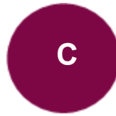
Trading, wholesale, distribution, rental & leasing